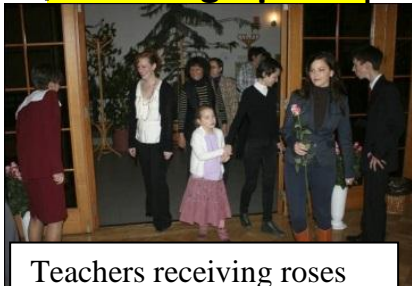
Teachers receiving roses from students upon entry