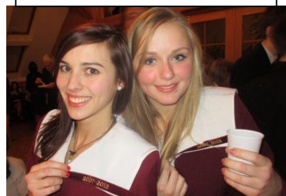
Two of my girls showing off their newly acquired ribbons