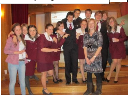
Me with part of the 12A class